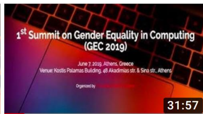
Greek ACM-W GEC 2019: Poster Flash Talks 2