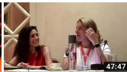
Greek ACM-W GEC 2019: Panel Women with