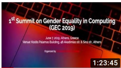
Greek ACM-W GEC 2019: Poster Flash Talks 1