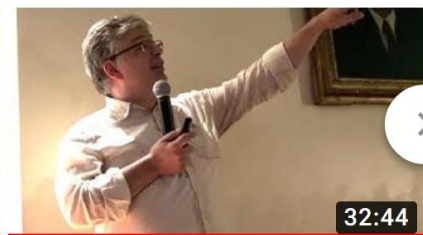
Greek ACM-W GEC 2019: Keynote 4 Aristotle Tympas