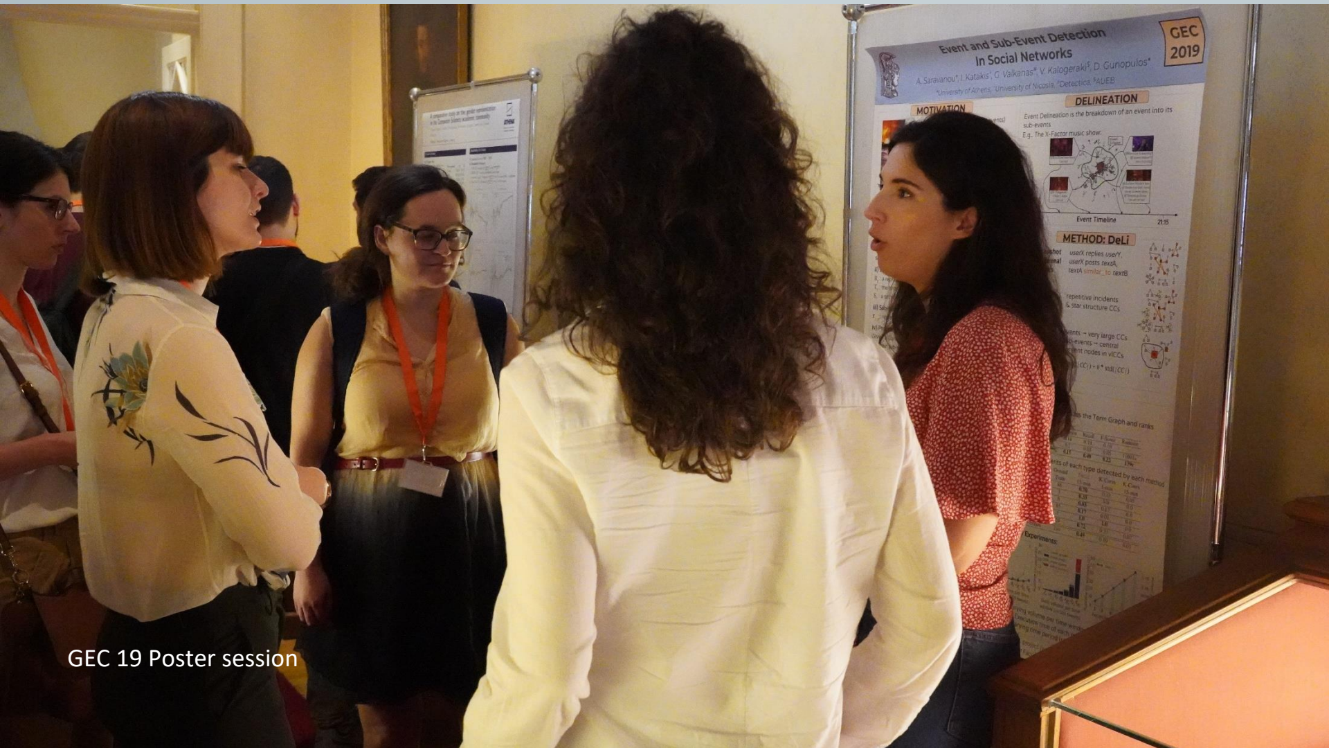
GEC 19 Poster session