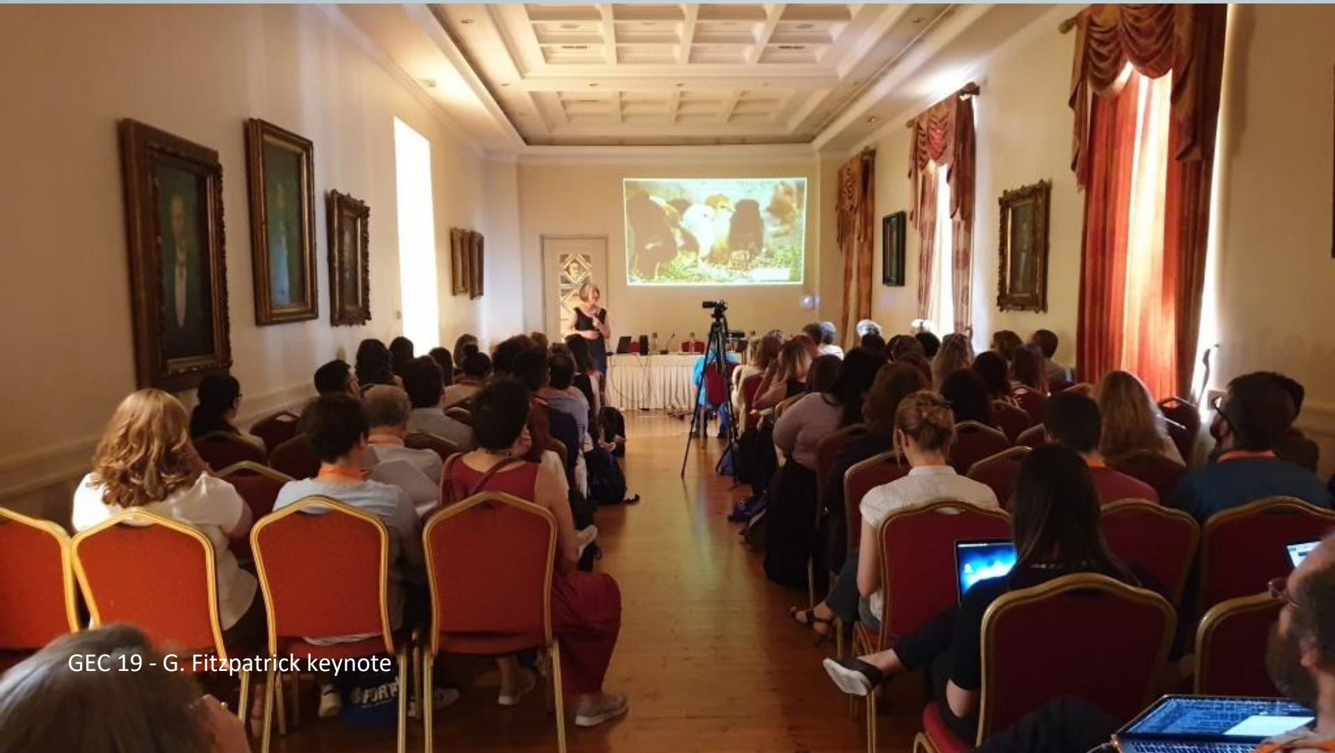
GEC 19 - G. Fitzpatrick keynote