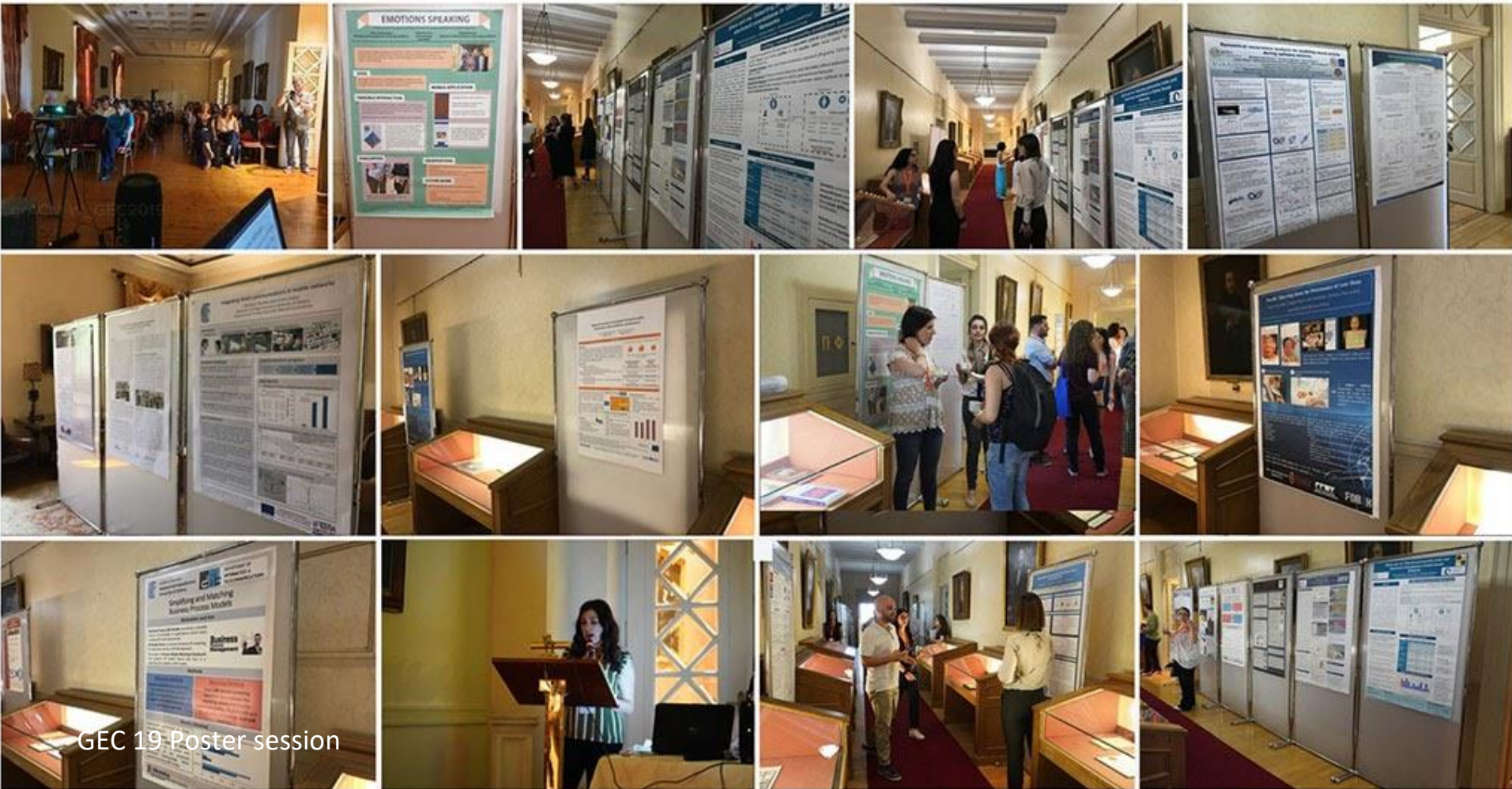
GEC 19 Poster session